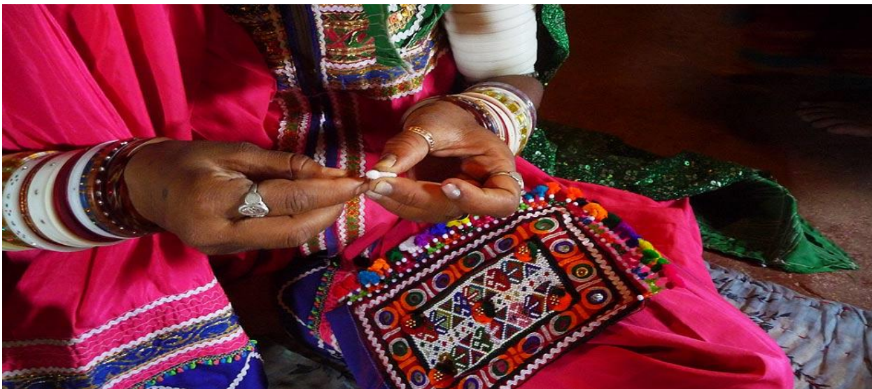
Beautiful Mirror work